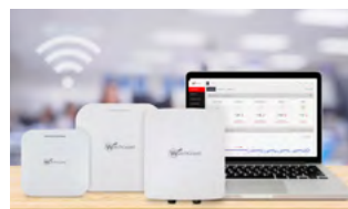
Secure Cloud Wi-Fi